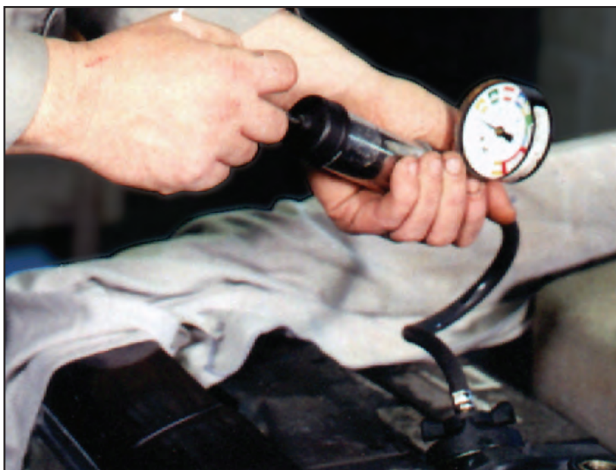
Figure 6: Pump the cooling system up to the pressure rating shown on the cap and let it sit for at least 10 minutes. If any more than about 1 PSI leaks out, suspect a leak.

Cooling systems aren't just about the engine; they play an important role in the continued life of your customers' transmissions. So, with the summer approaching, this is a great time to make sure that cooling system will be keeping things cool for you and your customers as the temperatures begin to rise.