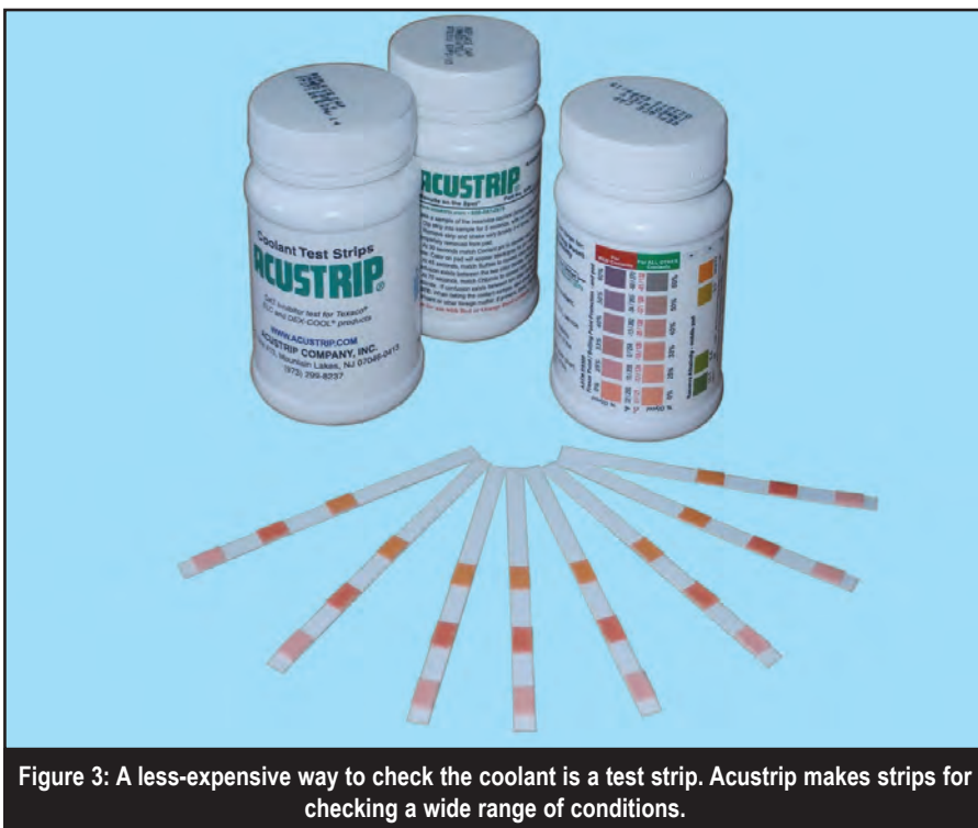
Figure 3: A less-expensive way to check the coolant is a test strip. Acustrip makes strips for checking a wide range of conditions.

coolant should be full and reasonably clean and clear. Any debris or contaminants indicate a problem that you'll need to check carefully.