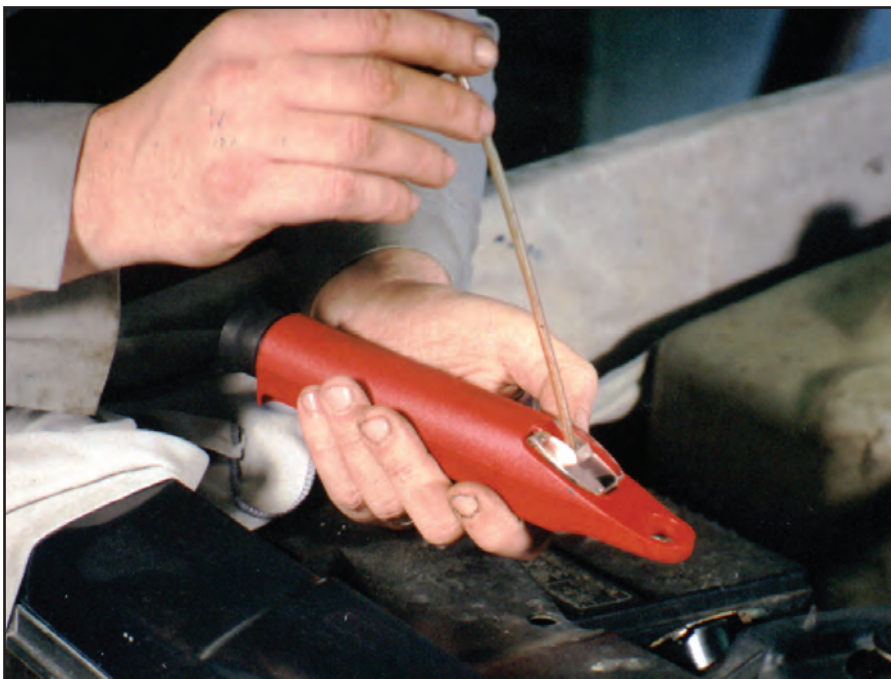
Figure 2: A refractometer is a great tool for checking the protection level for just about every type of coolant. It's easy to use, but can be a bit pricey.

Next remove the radiator cap (or system cap on some vehicles). The