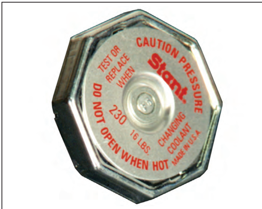
Figure 5: The radiator cap should say how much pressure it's designed to hold; this one's rated for 16 PSI. The cap should hold just about 16 PSI and release anything more than that.

We discussed how to check the cooler flow on page 36; we'll look at how to check the transmission fluid for signs of glycol contamination in next month's issue of GEARS .